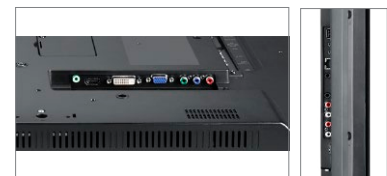
Versatile connectivity: VGA, DVI, HDMI, Composite, Component