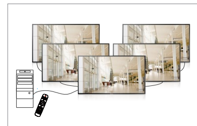
RS-232/ RJ45/IR for remote control