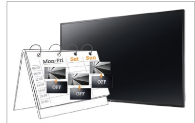
Built-in scheduler automatically activates and deactivates the PM-43 with designated input signal according to programmed schedules.